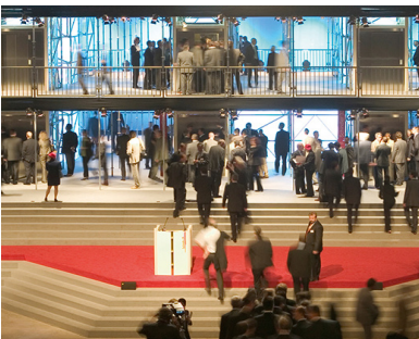
CS Barcelona Convention 04152020