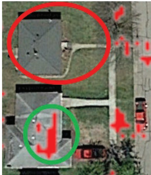
Bottom home can be connected, with the SM install locations predicted for the red shaded area of roof. cnHeat predicts the top home as unable to be served, preventing a failed truck roll.

The accuracy of the heat maps generated by cnHeat saves time and labor costs on customer installs. Because optimal installation locations are identified in advance, the installer can simply place the equipment immediately in the predetermined locations at the deployment site, then verify coverage from predicted to actual.