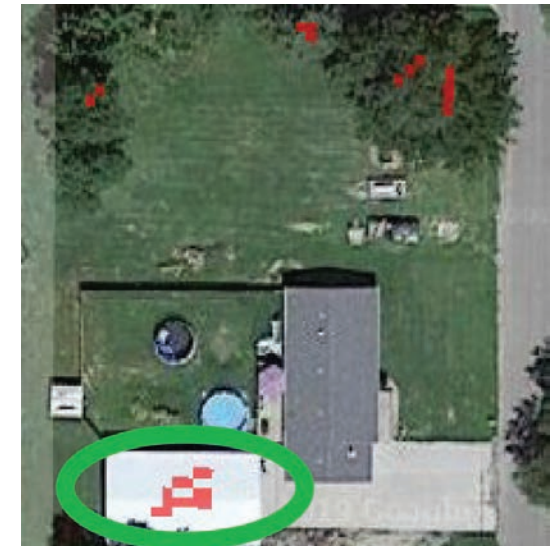
The home and surrounding yard fails installation, but service is predicted on the garage by cnHeat allowing a previously unconnected customer to now be connected.

cnHeat also allows for a quick check on previously failed installs, predicting those unique locations where service can be obtained that were previously overlooked – promoting customer satisfaction by turning a hurdle into a success story and securing continued business.