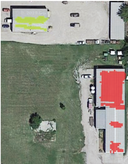
Top office building covered by a lower RSSI level (i.e. green) than the office building on the bottom (i.e. red).

cnHeat allows for RSSI to be understood at all locations. Different colors correspond to different minimum RSSI levels and these RSSI levels are user defined. Understanding the signal level received at a building translates into knowing the maximum plan that can be sold to a customer.